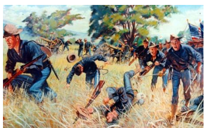
Gatling guns hauled by mules arrive to turn the tide at San Juan Hill