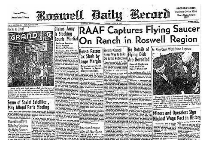
Roswell Daily Record announcing the "capture" of a "flying saucer."