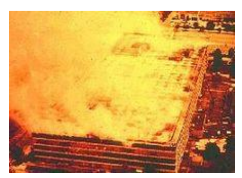
Conflagration underway, 1973