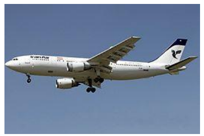
USS Vincennes and a similar A300B2-200